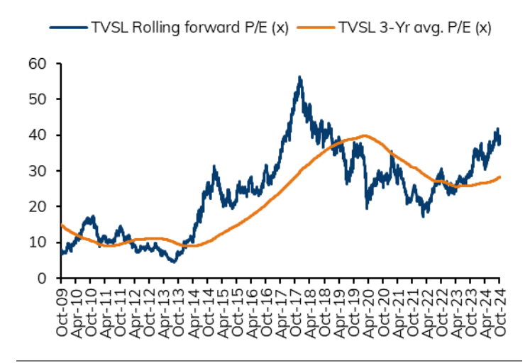
Exhibit 6: Three-year moving P/E